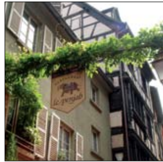
BOTTOM RIGHT A CITY CRISS-CROSSED BY MANY BRIDGES BELOW TIMBER-FRAMED HOUSES IN STRASBOURG EXTREME RIGHT PICTURESQUE HOUSES BY THE WATER