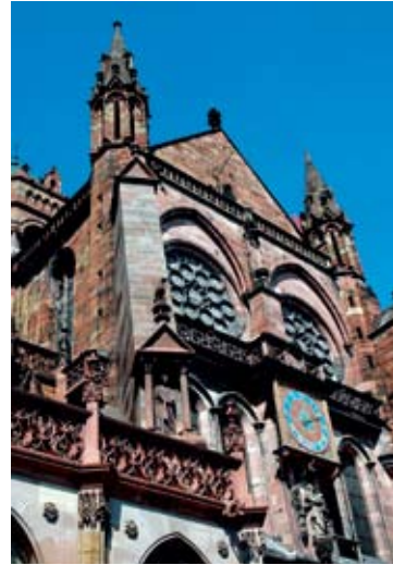
RIGHT MEDIEVAL FACADES OF BUILDINGS BELOW TIMBER-FRAMED HOUSES IN STRASBOURG

Apart from this handsome cathedral, Strasbourg houses several other medieval churches that have survived the many wars and destructions that have plagued the city. The Romanesque Église Saint-Etienne, partly destroyed in 1944 by Anglo-American bombing raids, the part Romanesque, part Gothic, very large Église Saint-Thomas with its Silbermann organ on which Mozart and Albert Schweitzer played, the Gothic Eglise Saint-Pierre-le-Jeune Protestant with its crypt dating back to the 7 th century and its cloister partly from the 11 th century.