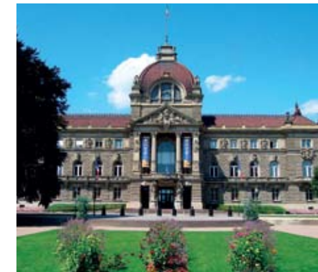
ABOVE STRASBOURG TRAM, THE PALAIS DURHIN; ONE OF THE LARGEST FULLY-PRESERVED LANDMARKS OF 19 TH CENTURY PRUSSIAN ARCHITECTURE TOP LEFT WALKING IS A BREEZE IN STRASBOURG WITH ITS COUNTLESS BRIDGES