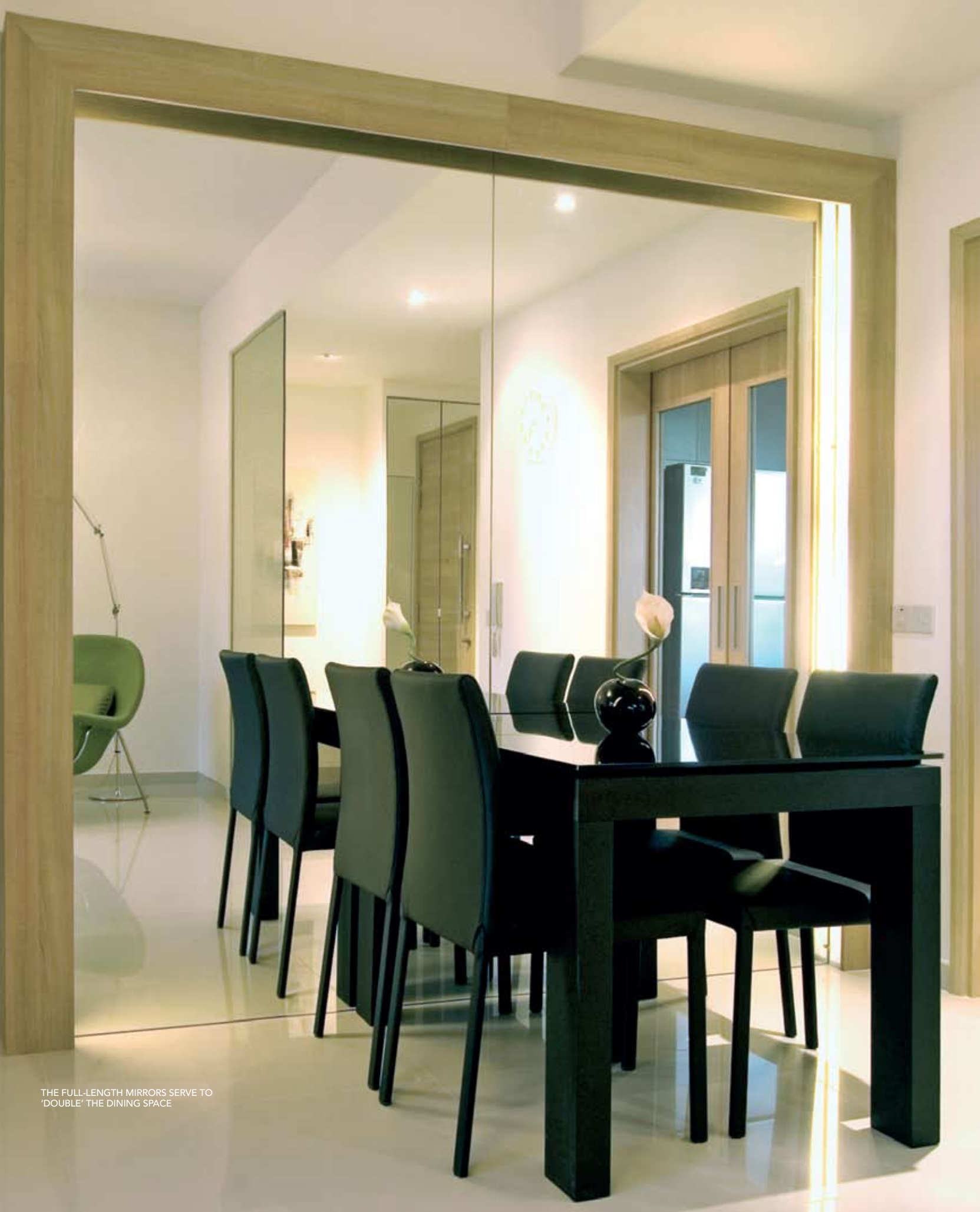
THE FULL-LENGTH MIRRORS SERVE TO 'DOUBLE' THE DINING SPACE