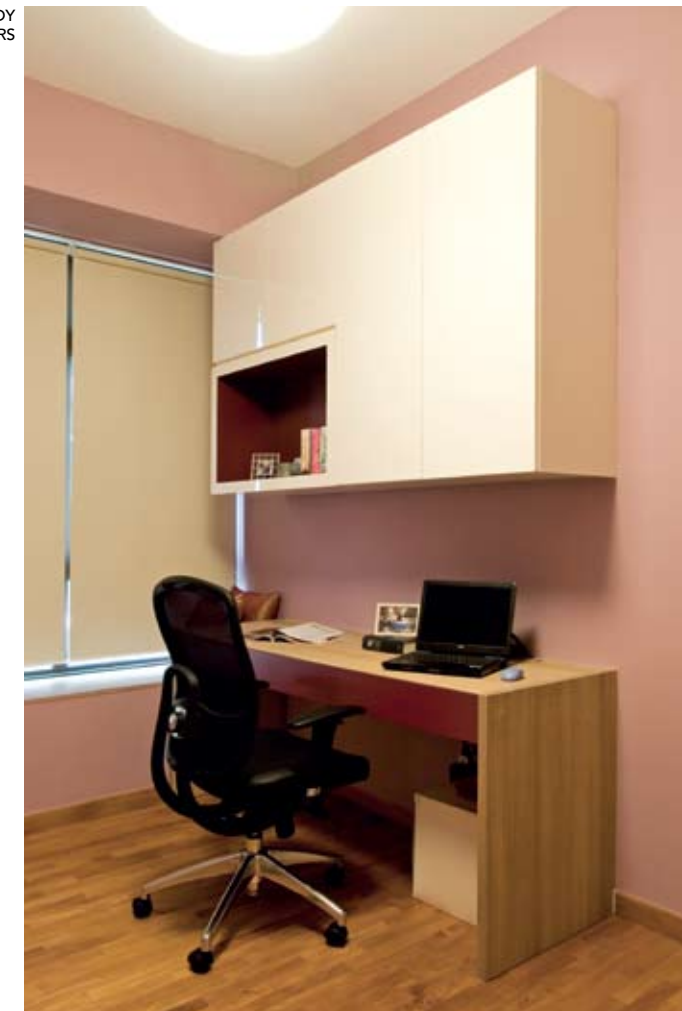
THE FUNCTIONAL STUDY TAKES ON CHEERY COLOURS

Instead of knocking down walls, the designers reconfigured the entrance to the living room by erecting a laminated fabric-glass panel partition. This 'open' concept means one can walk from the newly created entrance foyer straight into the living room. The colour scheme of the living room was kept simple, and the unique feature here is an exquisite cut stone feature wall on which the television is mounted. So as not to go over board with the floral motif, the designers opted for elegant two-textured white wallpaper with floral prints. On the opposite side of the living room is the dining area where tall mirrors, highlighted by recessed lighting at the sides, further the sense of space. The garden theme continues in the master bedroom. "We opted for a simple palette of materials, which is repeated throughout the apartment, creating a continuity that adds to the sophistication. In the bedroom, the aim was to create a glamorous, upmarket retreat that was cosy and welcoming – a 'Garden of Eden' where the couple could relax in," says Stanley.